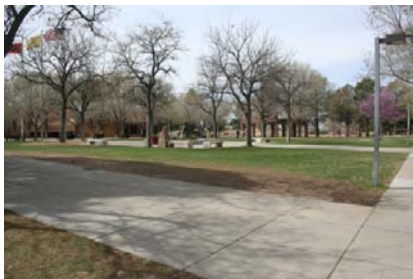
Open area with or without trees

There are several areas for outdoor exhibits this year – many of which offer delightful shade and grass. Special areas have been set aside for food vendors, vehicle and trailer displays. The Covered Stone walkway area precludes the need for canopies.