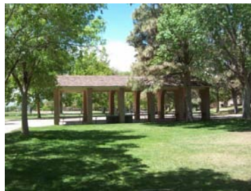
Covered Stone Display area