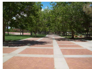
Vehicle Displays set on walkways